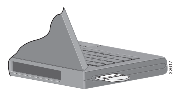
Figure 3-3 Inserting a PC Card into a Computing Device

Do not force the PC card into your computer's PC card slot. Forcing it will damage both the card and the slot. If the PC card does not insert easily, remove the card and reinsert it.